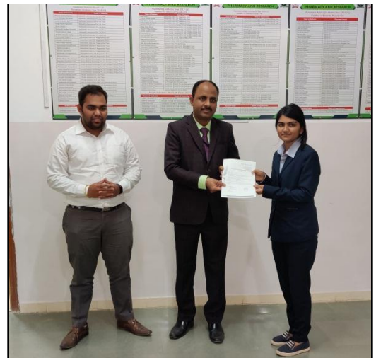
Offer Letter Distribution