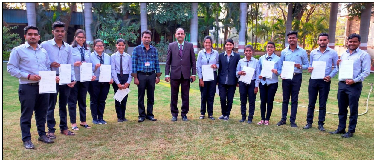
Shortlisted Students with Principal and Training & Placement Officer